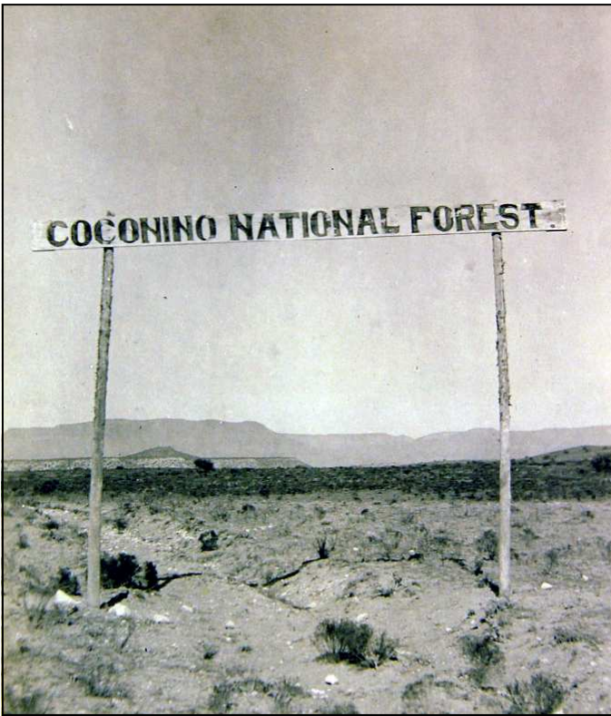
Forest Sign ca. 1910

The December 2011 Issue of Consumer Reports has an article on the health benefits from volunteering. Older adults apparently live longer and rate themselves at higher levels of health than those who don't volunteer. It goes to say that you don't have to be in excellent health to get these benefits. In a Baltimore study, older adults who volunteered at least 15 hours per week and rated themselves in just fair health at the start of the study, were the most likely to improve their stair-climbing speed over the next eight months compared to a control group who didn't volunteer. All volunteers studied had improved cognitive functions, greater happiness in life and not as much depression. Those who worked on environmental projects were only half as likely to have the symptoms of depression 20 years later. The experts think that volunteering and the sense of purpose it provides supported volunteer retention better than other programs like exercise groups. The article concludes with making sure that the group one volunteers for is a good match and is satisfying to one's particular talents, skills and interests.