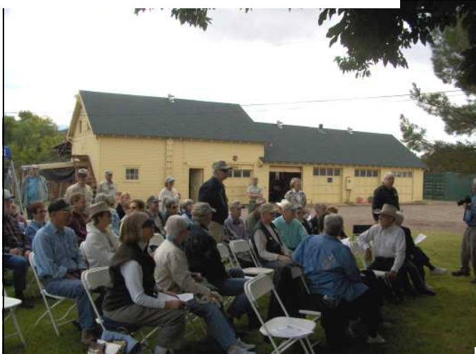
Annual Meeting Crowd