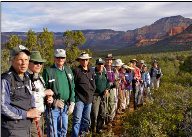
Chuckwagon above; Templeton below

Despite the wintry weather in December, the FOF Trail Patrol group managed to put in over 700 hours on the trails helping visitors and getting some exercise. January has been nicer and we have been able to have a couple of group hikes. The Forest Service is in the process of adopting several new trails, many of which are nice connectors to other trails. Our group checked out the new Chuckwagon Trail in the Dry Creek area. It is a nice, fairly easy trail from Dry Creek Road or Long Canyon Trailhead to Brins Mesa. The red rock views are superior. Our other group hike was from Little Horse Trailhead, down the Pathway to HT and Templeton. There were some nice bobcat tracks on the HT Trail near a water hole. We usually spend about three hours on these group hikes. The hikes are announced by e-mail to the Trail Patrol Group. If you would like to join Trail Patrol, please contact me by phone at: 928 634 3942 or by e-mail at: foftrailpatrol@gmail.com. Darl