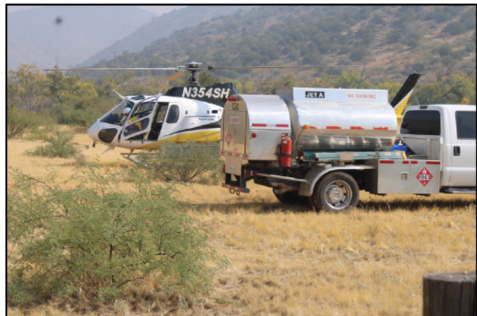
Helicopter refuel during our picnic