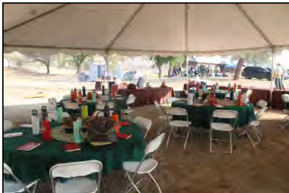
Lovely table set up