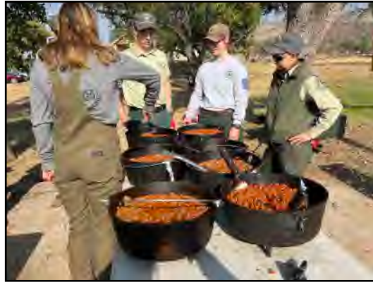
Wagyu Meat Chili