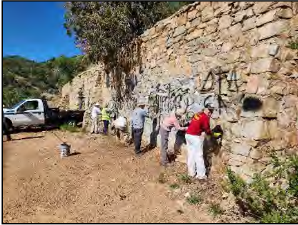
Prescott NF - Camp Verde