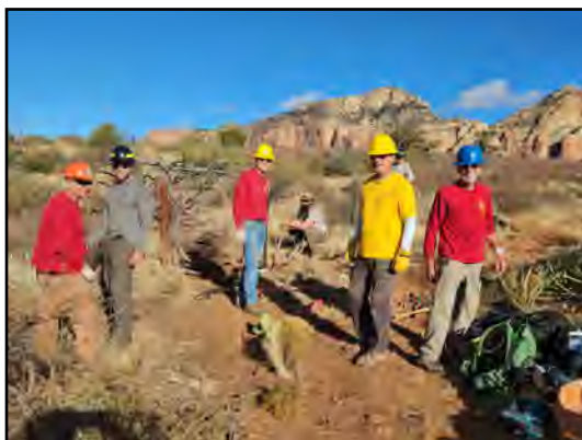
TM&C closing social trail on Rabbit Ear