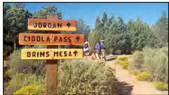
New sign at JT trailhead