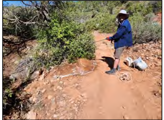
Bob Bear Trail