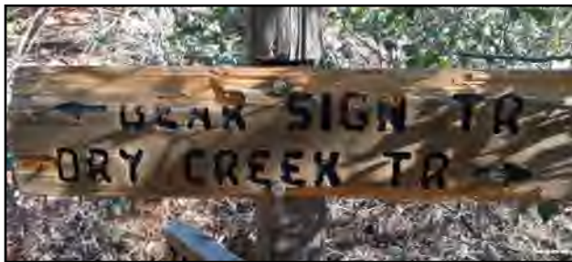
Bear damage to Bear Sign Trail sign