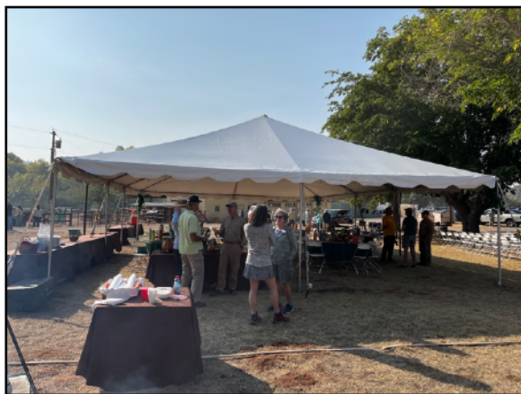
Lots of conversations and catching up being done