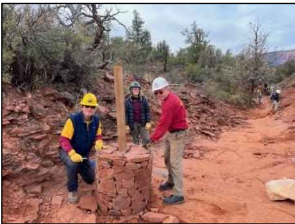
New Chuckwagon Cairn