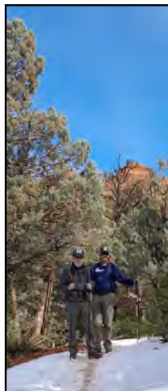
Hiking Safety & Comfort class