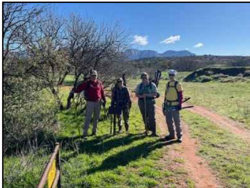
Heading out with Wilderness Crew