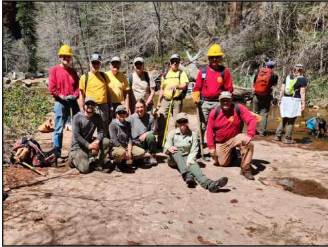
Taking a well deserved break