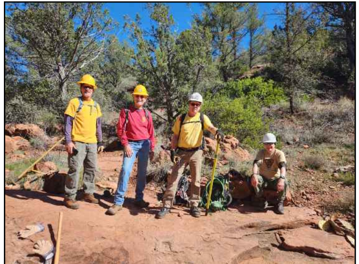
Crew ready to get to work