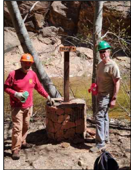
Rock cairn with trail sign