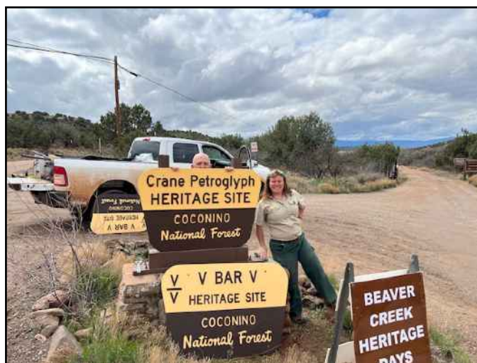
FOF volunteers assist with new signage