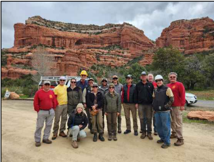
TM&C with Forest Service