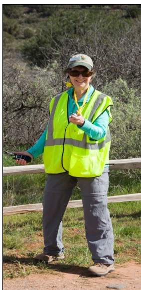
Parking Lot Team