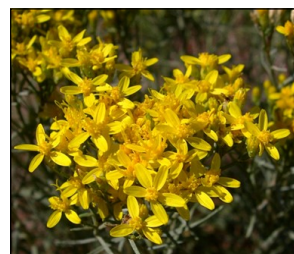
Top - Pink Flower Hedgehog Cactus Bottom - Broom Snakeweed