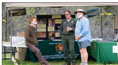
Our treasurer consorting with the Park Service