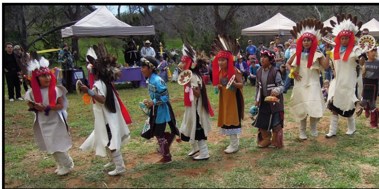
Hopi Youth Dancers

The project to digitize and catalog the historical/archaeological 35mm slides and prints for the Coconino National Forest continues in Phase 3 of the project. The slide portion of the project was completed in 2012. Work still continues on the print portion of the project. To date, we have processed 52,600 (78%) of 67,442 print images! Phase 3 entails transcribing the handwritten comments, from the margins of the slides and back of the prints, into a "photolog" database (MS Excel). This phase is by far the largest in terms of hours required for completion. We are 82% complete for the total project. The skills required to be a member of this team include a general comfort with using a Windows based PC, entering data into a spreadsheet, using an image (i.e. photo) viewer, and attention to detail. Training and hands-on work sessions will be provided.